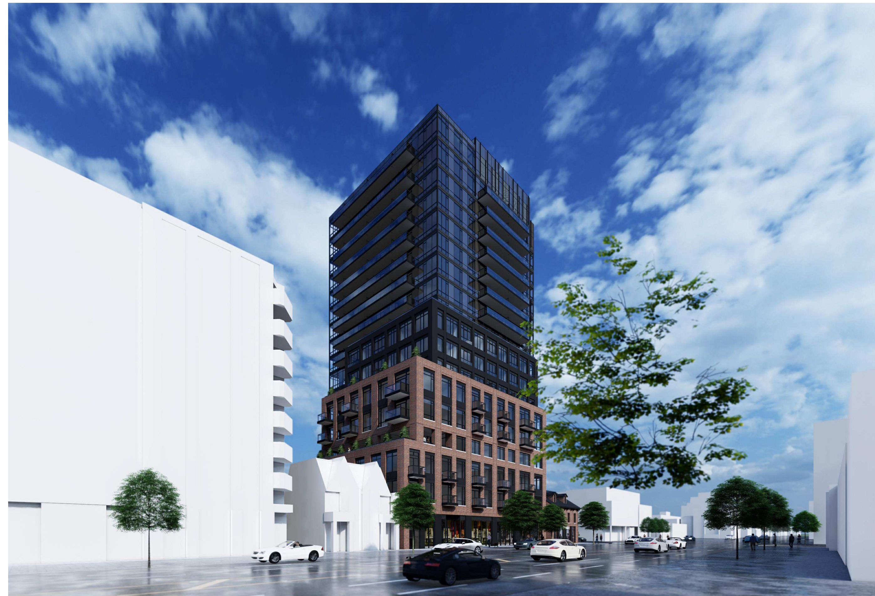
View along Bathurst St. looking North 02 dA6.1