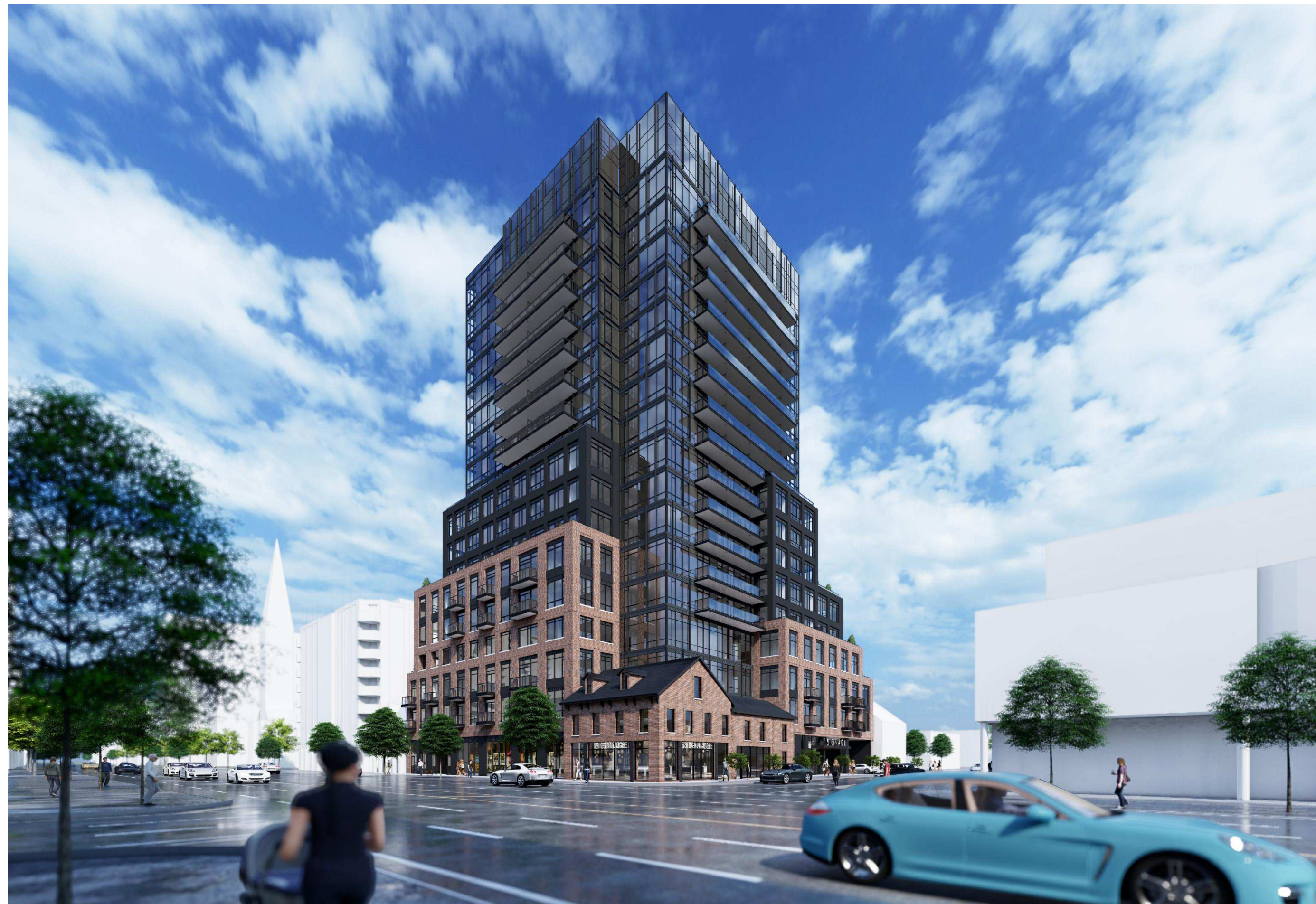
View along Bathurst St. looking South 01 dA6.1