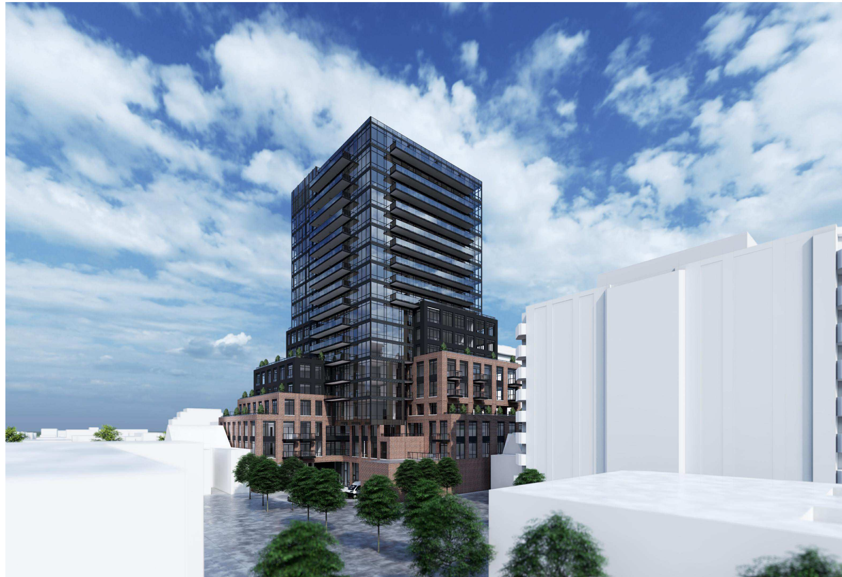
View of the Rear 01 dA6.2