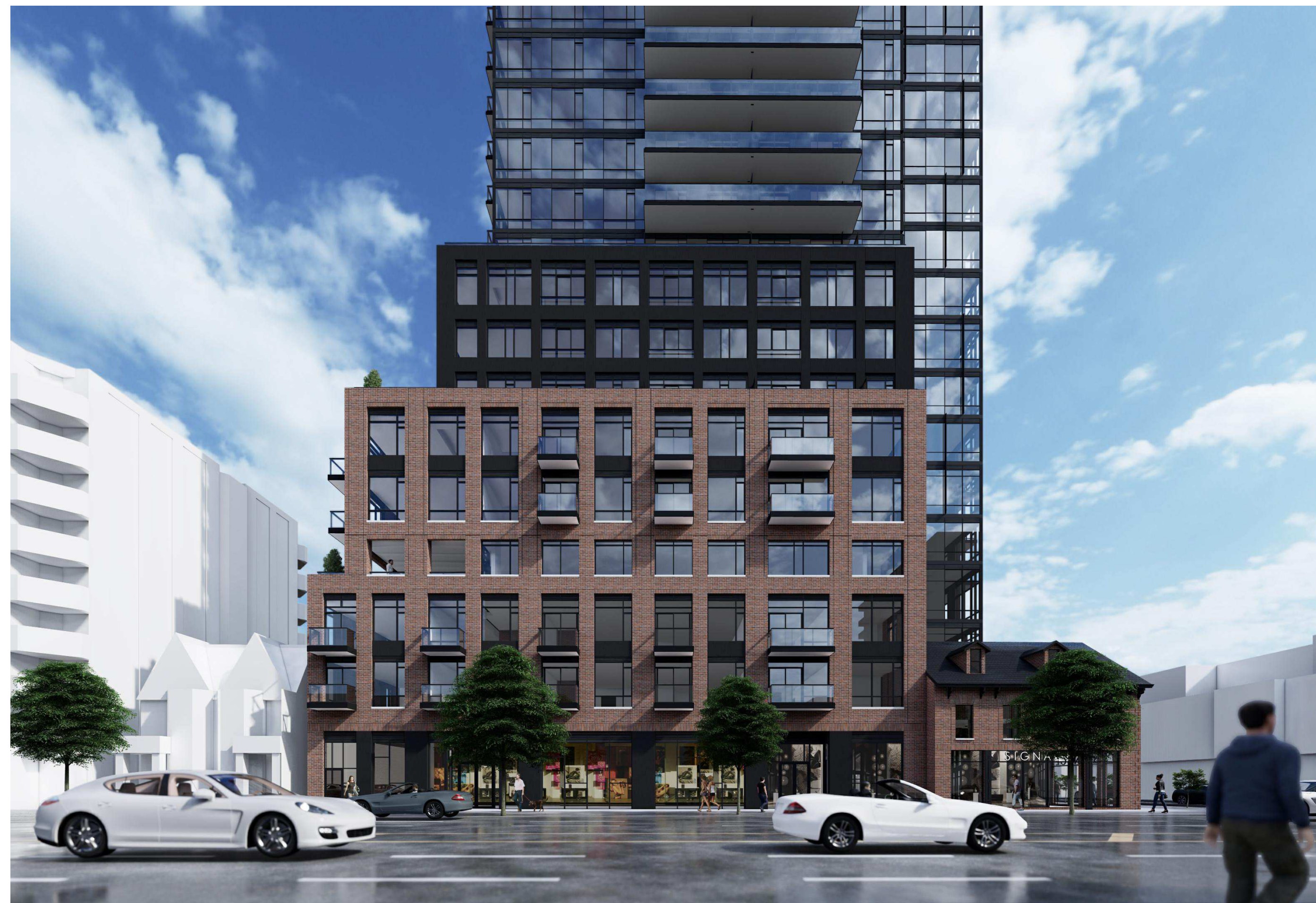
View along Bathurst St. 03 dA6.2