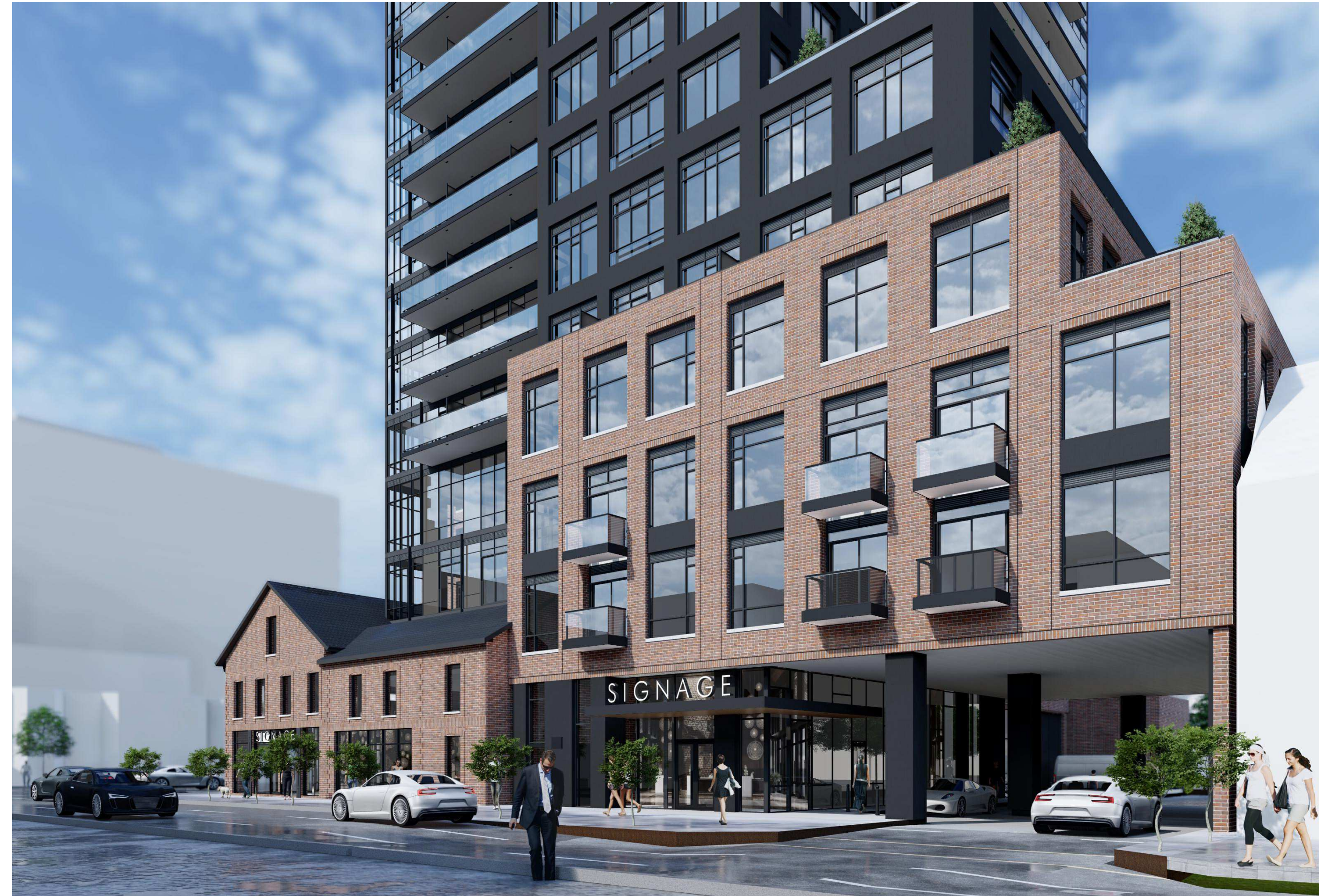
View of the Entrance 04 dA6.2

All Drawings, Specifications, and Related Documents are the Copyright of the Architect. The Architect retains all rights to control all uses of these documents for the intended issuance/use as identified below. Reproduction of these Documents, without permission from the Architect, is strictly prohibited. The Authorities Having Jurisdiction are permitted to use, distribute, and reproduce these drawings for the intended issuance as noted and dated below, however the extended permission to the Authorities Having Jurisdiction in no way debases or limits the Copyright of the Architect, or control of use of these documents by the Architect.