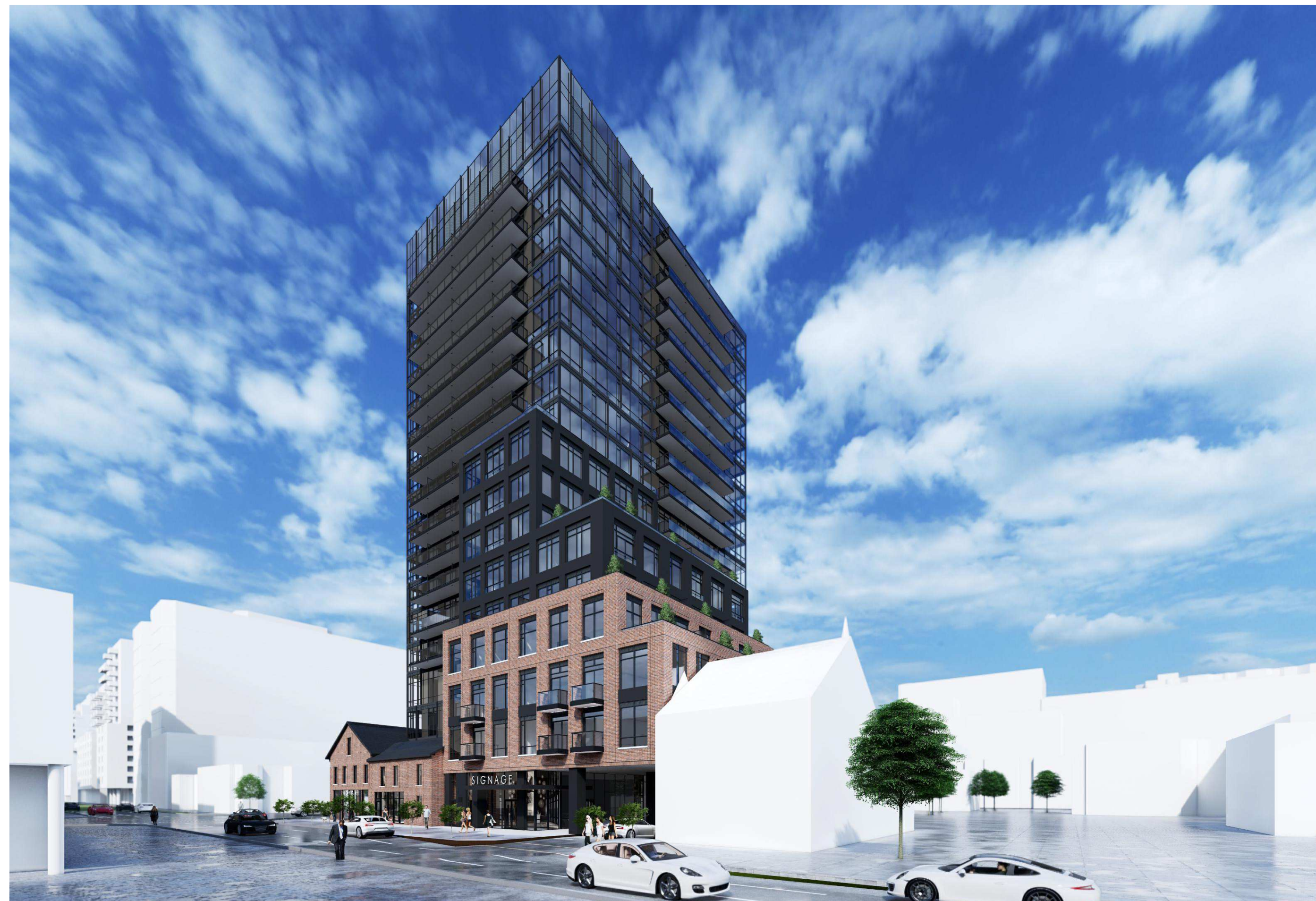
View along Richmond St. W. 03 dA6.1