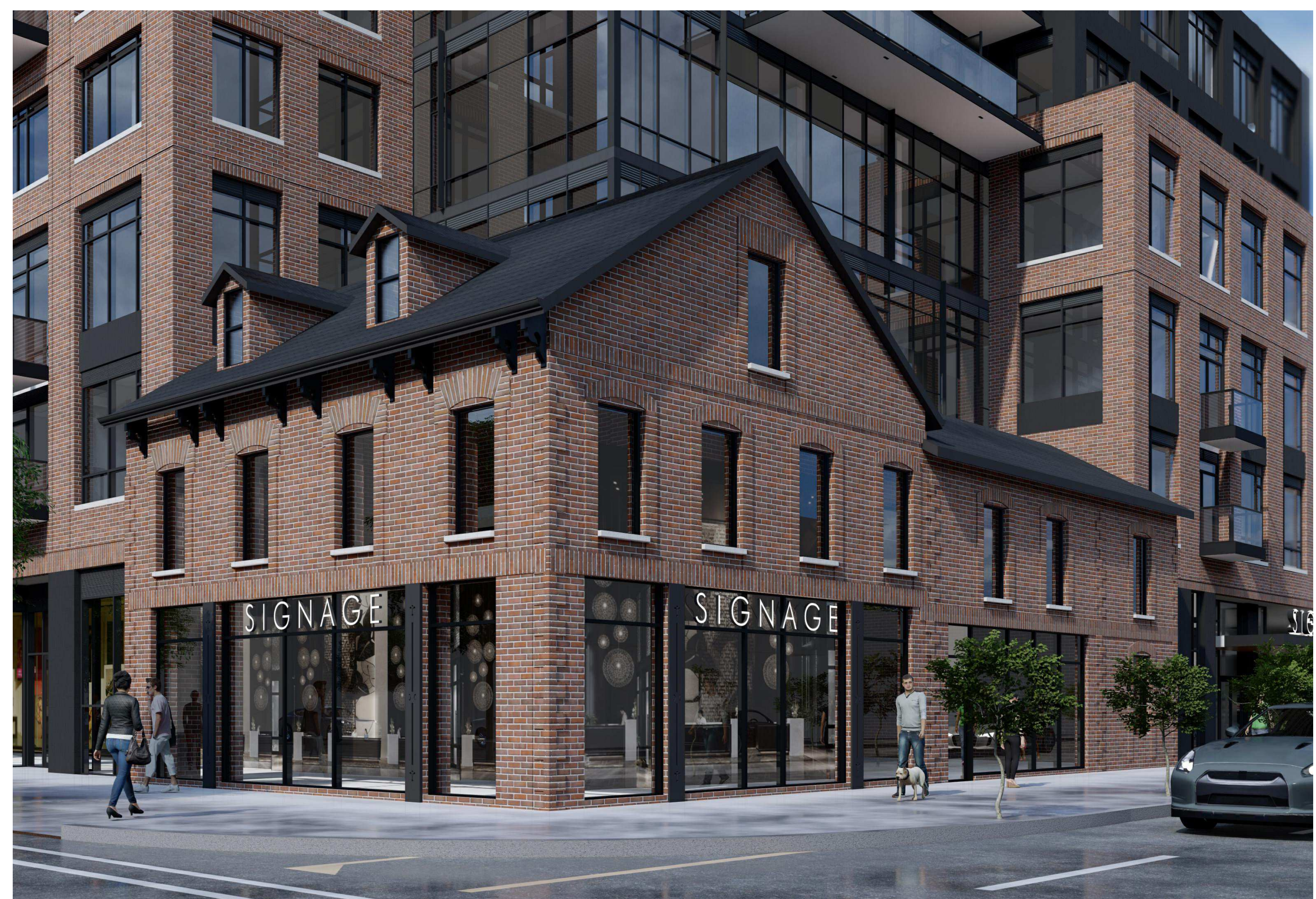
View of heritage 04 dA6.1

All Drawings, Specifications, and Related Documents are the Copyright of the Architect. The Architect retains all rights to control all uses of these documents for the intended issuance/use as identified below. Reproduction of these Documents, without permission from the Architect, is strictly prohibited. The Authorities Having Jurisdiction are permitted to use, distribute, and reproduce these drawings for the intended issuance as noted and dated below, however the extended permission to the Authorities Having Jurisdiction in no way debases or limits the Copyright of the Architect, or control of use of these documents by the Architect.